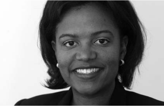
Senator Linda Dorcena Forry

In April 2013, Linda Dorcena Forry was elected to the Massachusetts State Senate. Senator Forry, a native Bostonian, is the first woman and person of color to represent the Commonwealth's 1st Suffolk District, a diverse and thriving cross-section of Boston that includes Dorchester, Hy5F.4(i)0.5(o74.